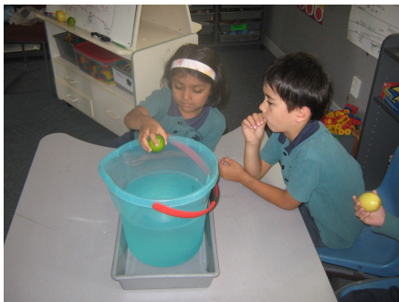
2. Year 3 students learning about floating and sinking