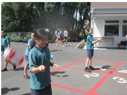
3. Year 6 students operating the whirling hygrometers they constructed to measure humidity